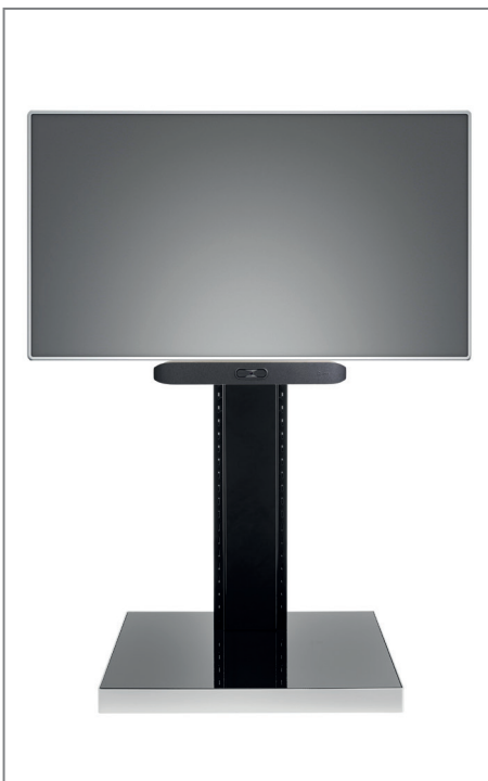
Installation example at Info-Tower Single L (Item no.: 1566)