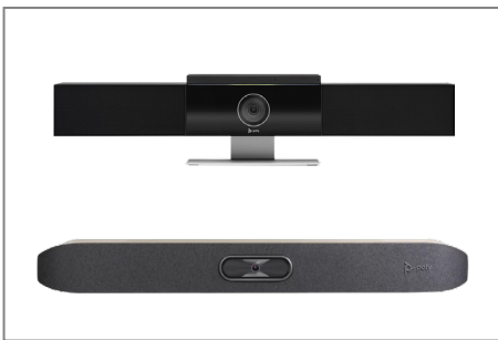
suitable with Poly Studio, Poly Studio X50 and X70

All fastening materials are included in the scope of delivery.